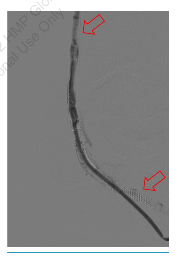
FIGURE 6. Example of mixed deep venous arterialization (DVA) failure types in a single case. Upper arrow demonstrates a Type 2 DVA failure within a graft, while lower arrow denotes a Type 3a pattern near the distal stent edge.

the decision making regarding clinically necessary reintervention may vary with different operators. As with both the Promise I and ALPS studies, we identified reinterventions to be predominantly due to combinations of arterial inflow and venous arch failures. While restenosis of previously treated arterial lesions is a well-described event, patency loss due to venous lesions is unique to DVAs. The etiology of these venous stenoses and occlusions is not defined. For transitional vein lesions, a potential cause is unrecognized, uncovered, resistant or recurrent venous valves. For these cases, the use of a dedicated valvulotome may confer some patency benefit. However, many transitional vein (Type 3b) failures were diffuse. This finding, along with frequent reocclusion of the revascularized pedal venous arch, suggests an aggressive process of intimal hyperplasia, possibly due to arterialization of these venous structures similar to what has been observed in hemodialysis fistulas.9 In addition, in our experience, the foot veins often demonstrated baseline obstructions prior to DVA creation, implying that longstanding nonreconstructible