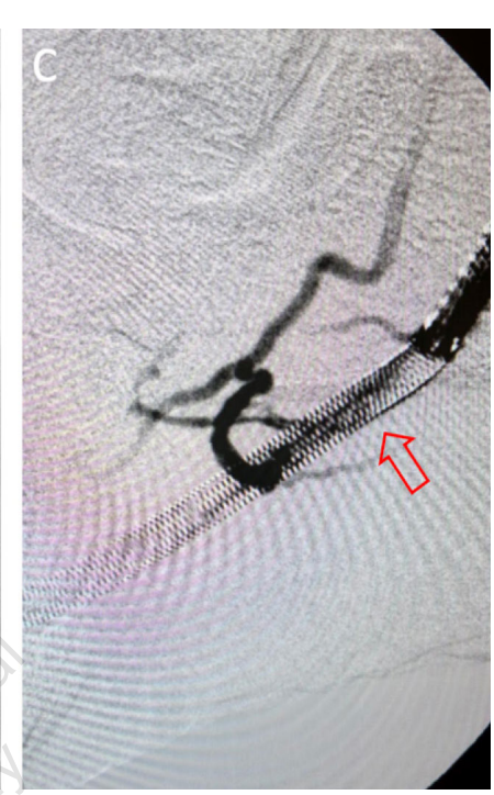
FIGURE 4. (A) Example of Type 3a deep venous arterialization (DVA) failure at distal stent edge, indicated by arrow. (B) Example of Type 3b DVA failure at transitional vein (lateral plantar), indicated by arrow. (C) Example of Type 3s DVA failure within transitional vein stent, indicated by arrow.

Classification of DVA failure types. Image review of reintervention procedures allowed for identification of sites of stenosis or occlusion contributing to DVA failure. Based upon these findings, we propose a classification of disease patterns based upon sites of occlusion or stenosis contributing to DVA failures (Figure 1). In this classification system, a pattern is characterized as a "failure type." Type 1 involves occlusions that affect arterial inflow, including lesions proximal to the DVA site (1a) or at the proximal stent edge of the DVA (1b). Type 2 involves occlusions within the graft. Type 3 characterizes occlusions that affect venous outflow, including lesions at the DVA distal stent edge (3a), within transitional veins (medial/lateral plantar veins) (3b), or within previously placed stents in the transitional veins (3s). Type 4 involves lesions of the venous arch of the foot, specifically a recurrent absence of filling of the entire pedal arch that was patent at the time of the initial DVA completion. Type 5 cases are "undefined" because the exact location of the culprit lesion(s) causing DVA failure could not be clearly identified. Although distinct type and subtype patterns have been delineated, it is possible for DVA failures to concurrently exhibit multiple failure types.