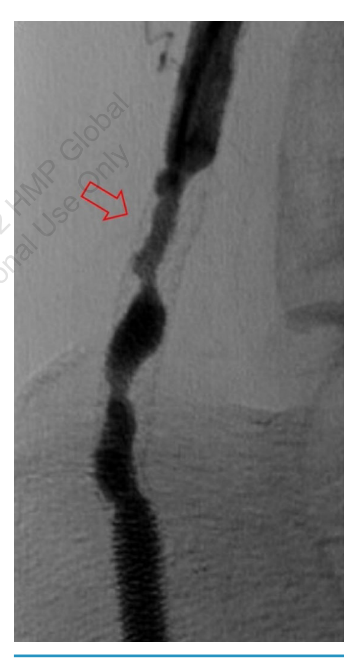
FIGURE 3. Example of Type 2 deep venous arterialization failure within graft. Arrow points to the site of occlusion within visible outline of stent.